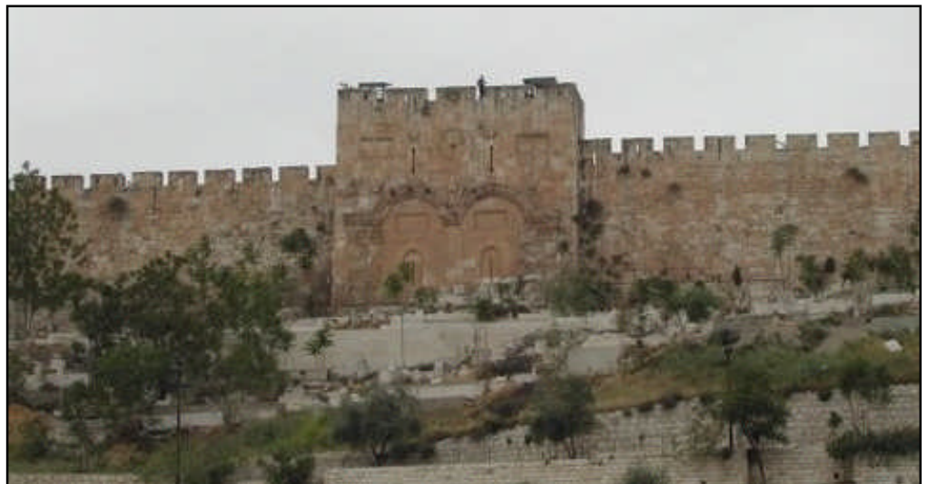
The Golden Gate or Messiah's Gate